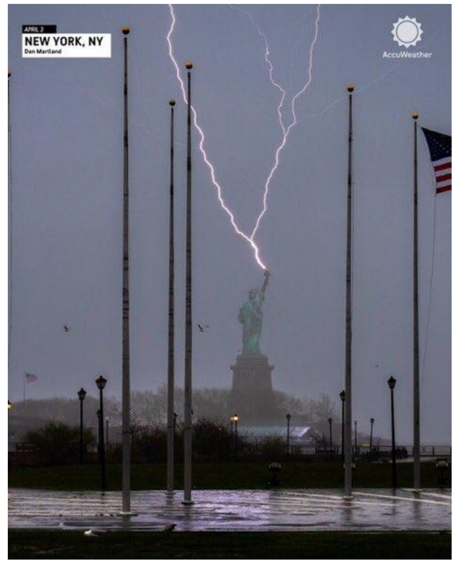
Luke 21:28 But when these things begin to come to pass, look up, and lift up your heads; because your redemption draws nigh.

As all these events swirl around us, we will continue to Praise our Great G-d and walk in His ways. And we want to invite you to join us for Passover and enjoy the Seder with us.